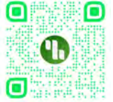
scan for more info

Discover a world of handmade wonders and unique treasures, carefully curated to add an extra sparkle to your Mother's Day celebrations. For an up-to-date list of vendors, visit UHFCU.com/craft-fair .