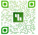
scan for more info

Get a $50 Visa Reward Card when your friend opens a new checking account and completes the following within 60 days of account opening: Completes five (5) UHFCU debit card purchases totaling at least $50 AND enrolls in eStatements. This offer is available to new UHFCU members who open a new UHFCU checking account within 90 days of establishing membership. Membership eligibility requirements and certain restrictions may apply. For more information on Refer-A-Friend, visit UHFCU.com/refer .