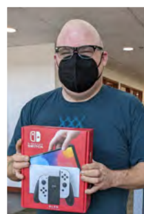
KOA - Nintendo Switch Winner

A big MAHALO to everyone who participated in our many contests over the summer and helped make them a success!