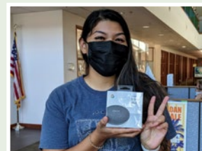
Floresa Google Home Mini Winner